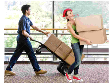
Example of self carry

Load Out: Exit through Loading docks in exhibit hall A & B Sunday August 5, 2018 5:00 pm to 12:00 am Monday August 1, 2018 8:00 am to 11:00 pm